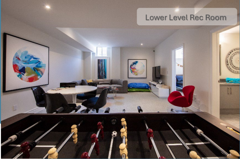
Lower Level Rec Room