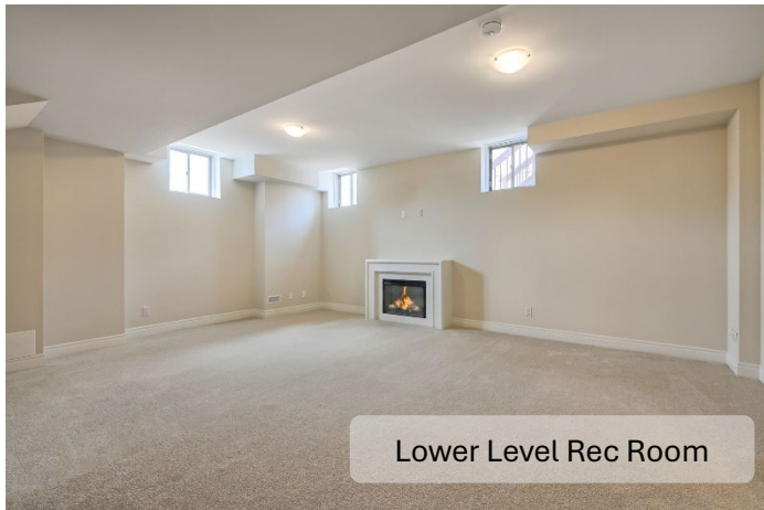
Lower Level Rec Room